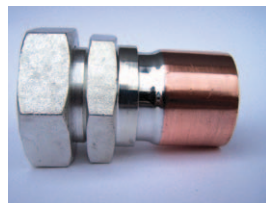
Rotalock Straight Connector

Manufactured in accordance with AS1677.2