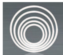
Rotalock Teflon Gasket Packet of 5