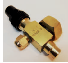
Brass Rotalock Service Valve (Single Access)