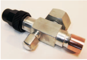
Rotalock Receiver Valve (Single Access)