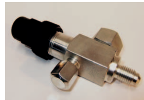
Rotalock Valve Flare