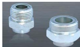
Rotalock Male Tube Connector OD Solder