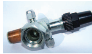
Rotalock Service Valve (Dual Access)