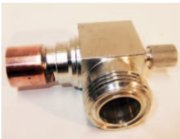
Rotalock Male Elbow Connector c/w Access