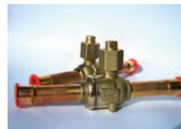
Ball Valve, Standard